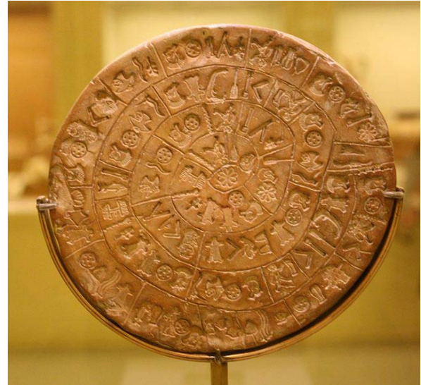
Figure 4: Phaistos Disk (clay tablet, side A, 2 nd mill. BC, Archaeological Museum of Heraklion). 44