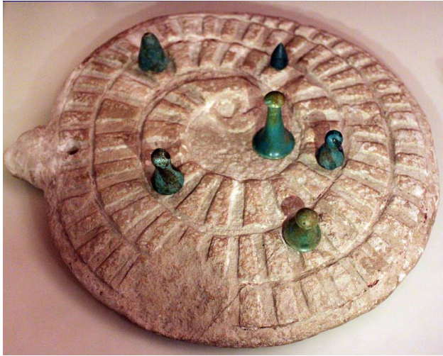
Figure 3: The Game of the Snake – Mehen (Limestone, early dynastic period, c. 3000 BC, Egyptian Museum of Berlin, Creative Commons). 41

The history of games has shown that ancient societies did not distinguish between activities linked to sacred and profane domains, 42 and that the first board games were used toward religious and divinatory ends. 43 The Myth of the Eternal Return as well as other works by Eliade such as The Sacred and the Profane leave no doubt as to the veracity of this hypothesis.