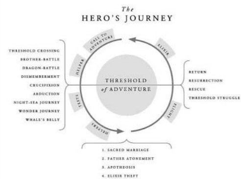
Figure 1: “The Cosmogonic Cycle of regeneration” (after Campbell 1949: 210).

according to mainstream historians, no documented contact with one another. 9 A student in the Platonic tradition, Campbell advanced theories regarding what he believed corresponded to a single, recurrent and universal history that had left its imprint for all of eternity upon our narrative, mental and spiritual structures. He represented what he defined as a cosmogonic cycle of regeneration in the form of a circle (Figure 1): 10