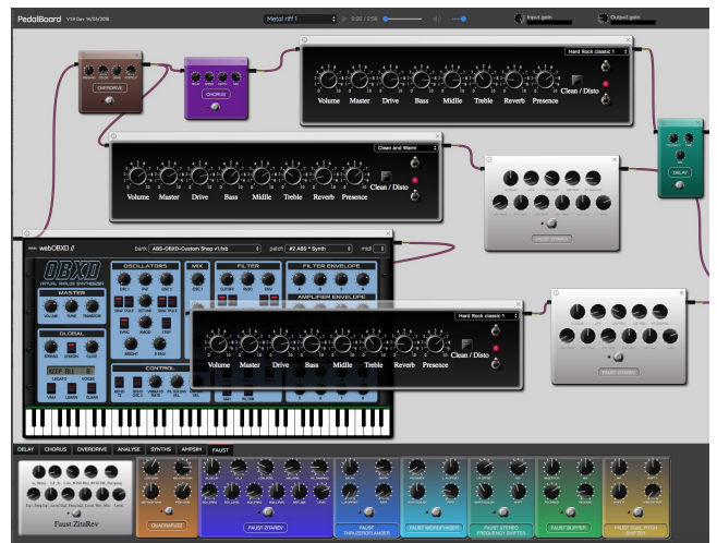
Figure 2: Different plugins connected inside a virtual pedal board. In black: some amps simulators

Here, we will detail first how we built on these previous works in order to generalize our approach towards any tube amp simulations. Instead of simply emulating a single guitar amp, we have now a versatile amp designer where one can select and tune the different parts that compose an amplifier: preamp, tonestack, power amp, speaker simulation, reverb, ... and then assemble those in different topologies, using filter banks between or inside these stages (Fig. 1). This modular tools make it possible to create specific amp designs targeted to get clean, crunch/bluesy, classic rock distortion, hi gain/metal sounds, etc. The final result can be a single specific amp or some multi channel amp with switchable designs 2 (ex: a clean and a crunch channel).