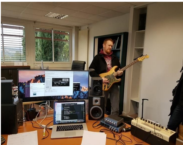
Figure 3: A typical benchmark/demo setup: a guitar, a low latency sound card, some speaker and a Web browser with our Web Audio apps running.

We did the proof of concept that many plugins could be easily included from multiple origins: (1) written in pure JavaScript / Web Audio -we made a dozen of such plugins, including the guitar tube amp simulators, and ported some others created by other developers (such as a general midi synth, etc.), (2) WebAudioModules (VST/JUCE native plugins ported to WebAssembly/AudioWorklet) or (3) written in FAUST, a popular DSL for writing DSP code, here again ported to WebAssembly/AudioWorklet. Other sources / importers are planned (eg. MAX DSP/Pure Data). Most plugins are controllable using midi controllers. We will demonstrate how easy this scheme works 3 .