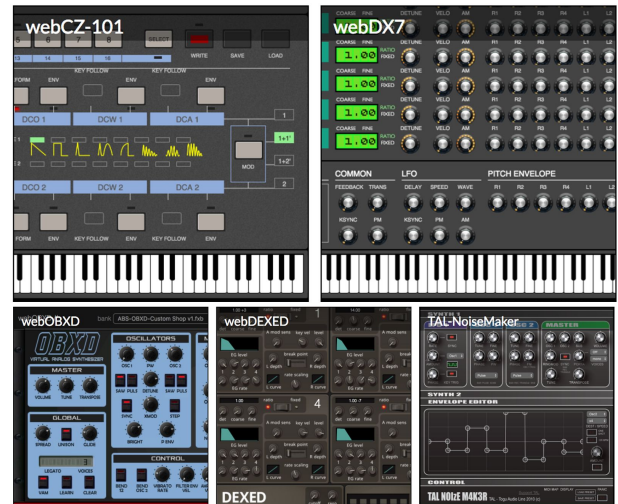
Figure 2: online WAM instruments

Another group has been developing Web Audio Modules (WAMs) since 2014 [3]. WAMs are high level audio plugins for the Web browser and have a C++ API, like native plugin formats. The WAM team ported to Web Audio famous commercial synthesizers such as the Yamaha DX7 or the Oberheim OBXd. See Figure 2.