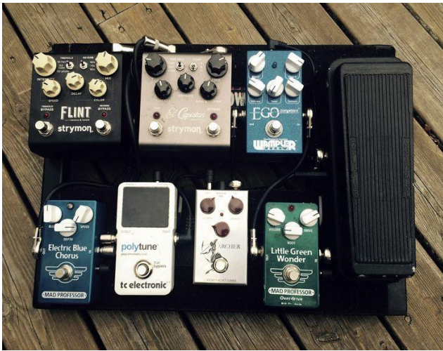
Figure 2: A real pedal board used by guitarists. Pedals are chained together before going to the amplifier.

For the WASABI project [6], the WIMMICS team from INRIA/13S/CNRS developed the first online digital emulation of a tube guitar amplifier: the Marshall JCM 800, a popular amp used by many classic rock artists (AC/DC, Led Zeppelin, Guns and Roses etc.) [1, 2]