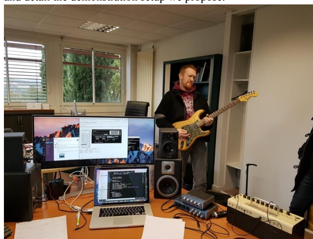
Figure 1: Typical demo setup: a guitar, a low latency sound card, speakers, and a Web browser with the apps running.

Finally, in section 4, we will conclude with some perspectives and detail the demonstration setup we propose.