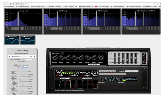
Figure 2: Full GUI of the tube amp guitar emulation, with debug tools displayed (freq. analyzers, advances settings etc.).

the electronic schematic with tools like the industry standard SPICE analog circuit simulator to translate the circuit into equations to be solved. These general equations are typically nonlinear differential algebraic equations that may be solved using integration methods, roots solver algorithms, and sparse matrix techniques. SPICE can produce C++ code ready to be executed. However, it is often necessary to make simplifications and optimizations to achieve solutions suited for real-time processing. This is critical for the modeling of the vacuum tubes used in guitar amplifiers with their typical interactions with other parts of the circuitry (see [1] for a review of common techniques). Also, the physical approach usually assumes perfect behavior of the electronic components used (resistors, capacitors, tubes, etc.) making it difficult to render the typical empirical design / fine tuning, ala "musical instrument making", of the tube-based guitar amps in which much of the coloring of the sound comes indeed from the limitations and non-linearities of the electronic components used.