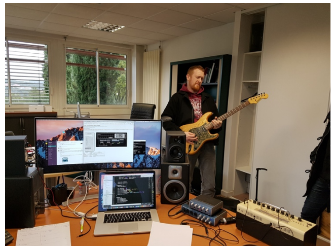
Figure 2: Typical setup for a demo / comparison with native amp simulations