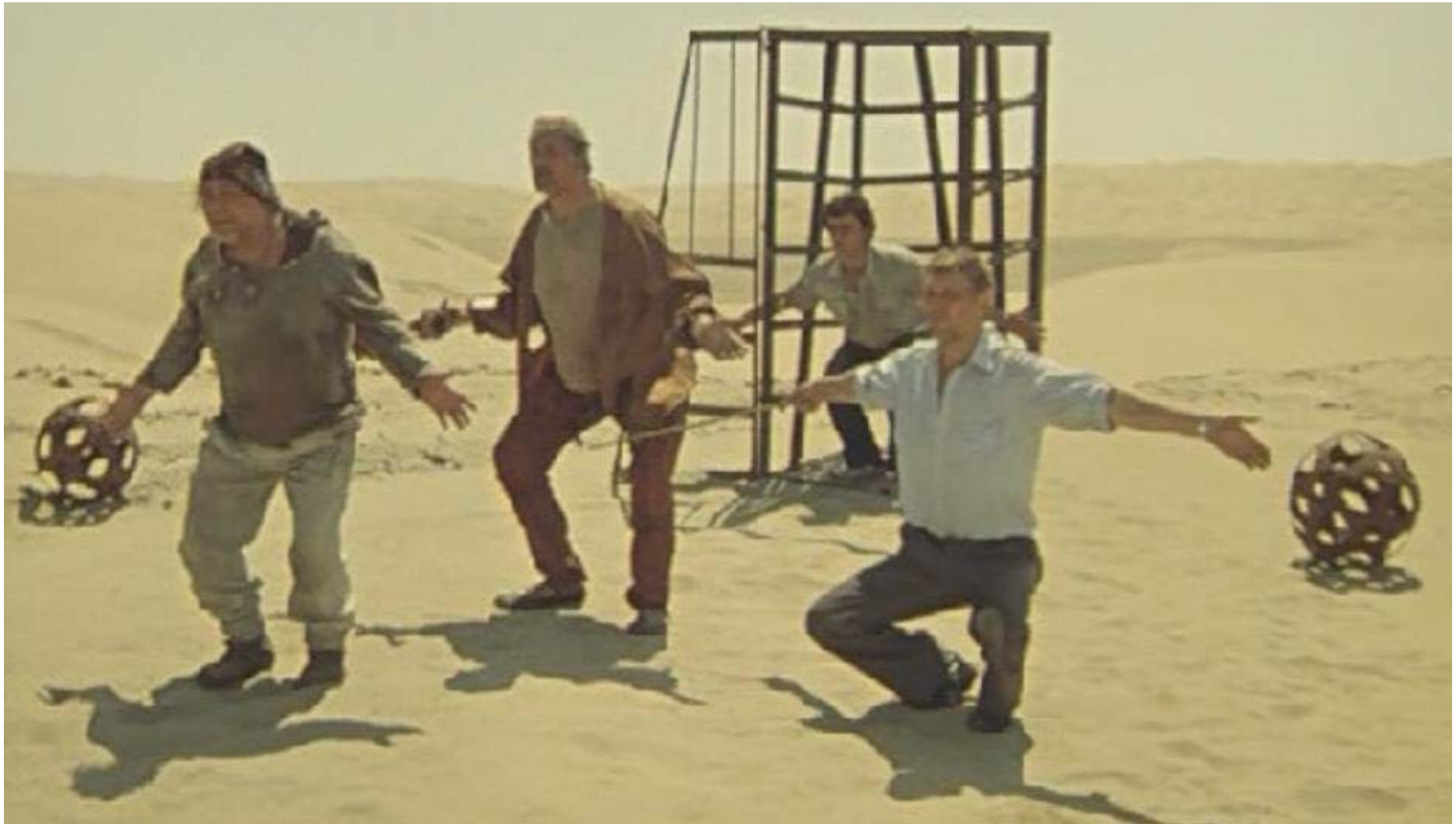
FIGURE 5 GREETING AN ETSILOP (POLICEMAN) AFTER PERFORMING IN A CAGE