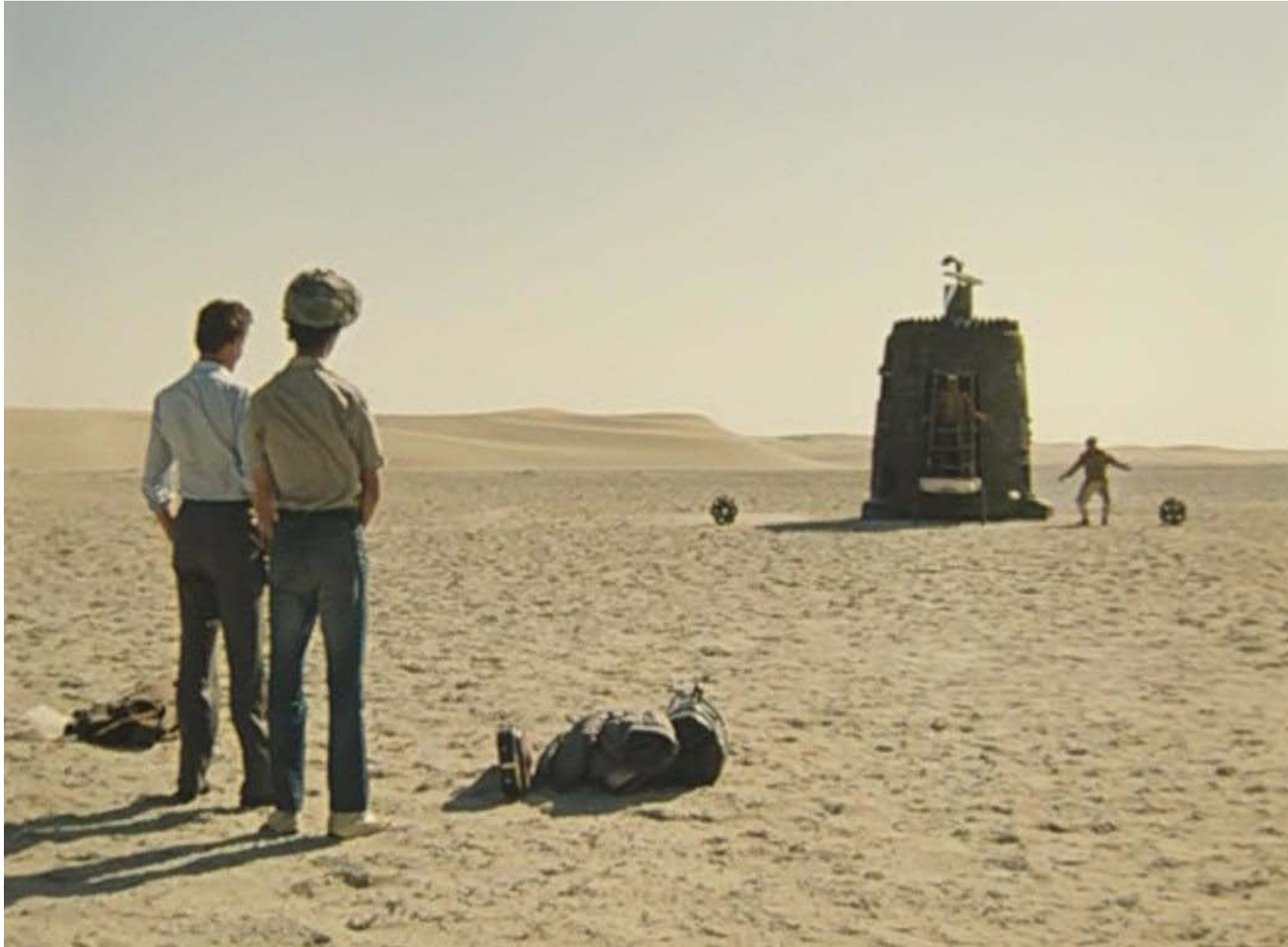
FIGURE 1 THE FIRST ENCOUNTER